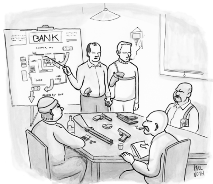
"The only thing we didn't plan on was falling in love."