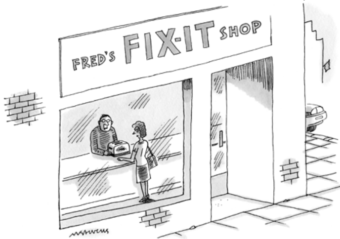
"It pains me to tell you this, but it ain't broke."