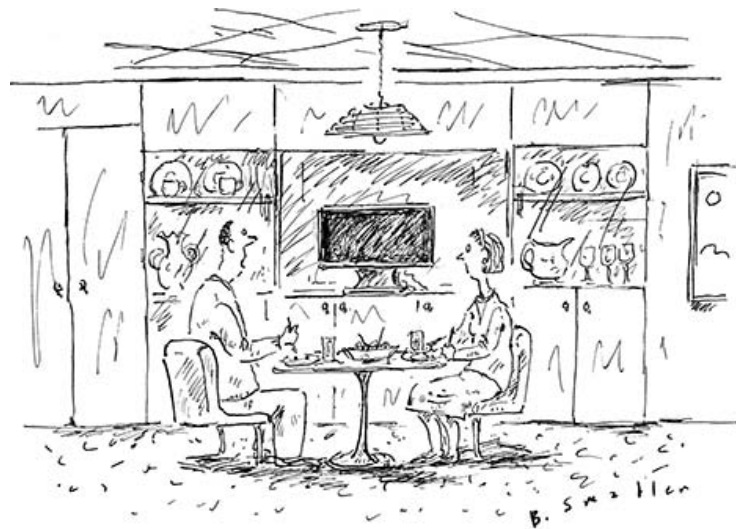
"It's just if the TV isn't on I never know where to look."