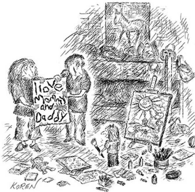
"Thank you, honey, for your vote of confidence in our parenting decisions."