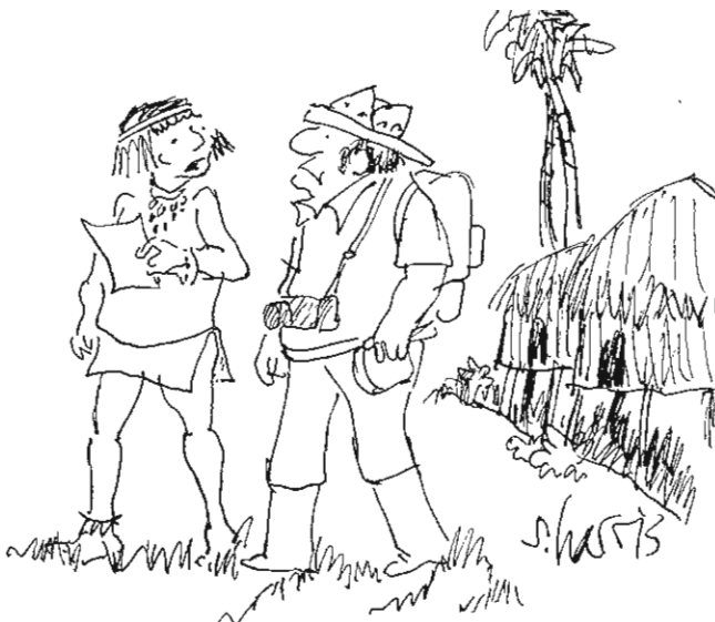
"You can't build a hut, you don't know how to find edible roots and you know nothing about predicting the weather. In other words, you do terribly on our IQ test."