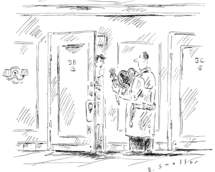
"I've changed the locks and taken out a restraining order, so no, I won't be your valentine."